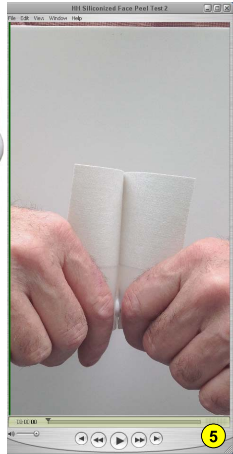
Peel Test 2 Video Clip

Set-up (photo 1): A line of Sealux-N 65mm long x 12mm wide was sandwiched between the red tinged siliconized faces of two layers of HydroHALT and allowed to cure.